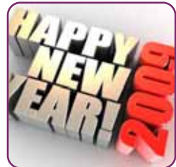
Things could be worse