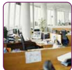
Protecting your income