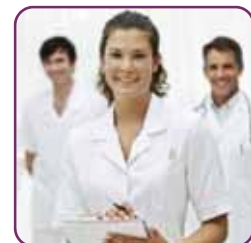
Protection in a recession