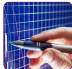
Turning a loss ...