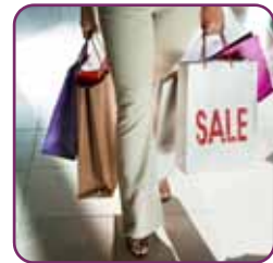
Shopping can help!